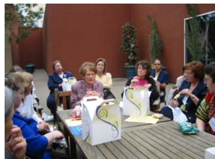
Clinical Laboratory Educators Meeting