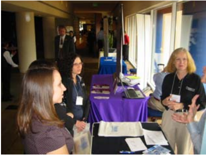
Exhibitors from Baylor Healthcare