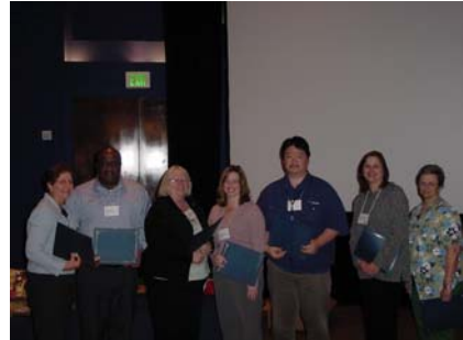
Omicron Sigma Recipients