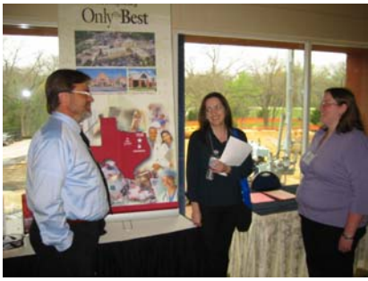
Exhibitors from Tyler