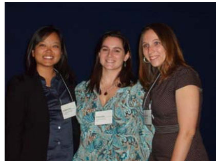
Student Forum Officers