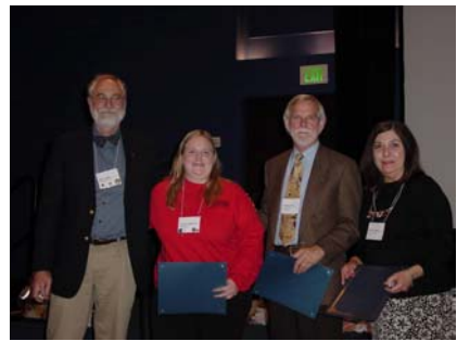
Omicron Sigma Recipients