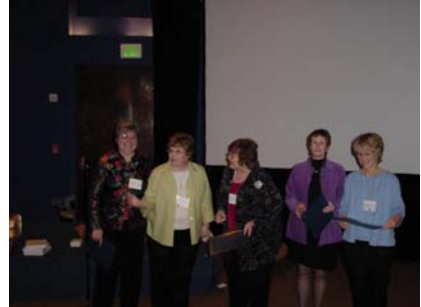
Omicron Sigma Recipients